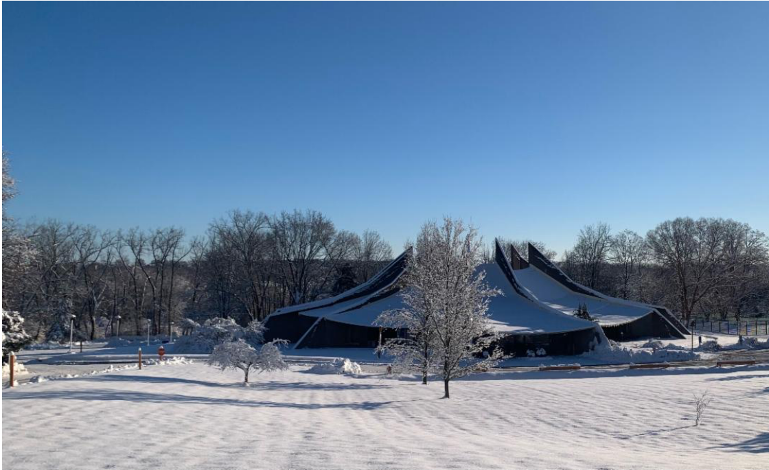
January 2024

"Nourishing Spirit, Building Community, Working for Justice"