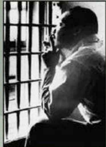
Dr. King sits in a jail cell in the Jeffers County Courthouse in Birmingham, AL

While in prison, he wrote the famous " Letter From a Birmingham Jail ," in response to a published letter written by eight Christian and Jewish clergy who advised African Americans to wait patiently for justice. Dr. King's response outlined in concise terms exactly why African Americans could not wait any longer for their freedom. The letter was so forceful and persuasive copies were circulated and printed all over the world.