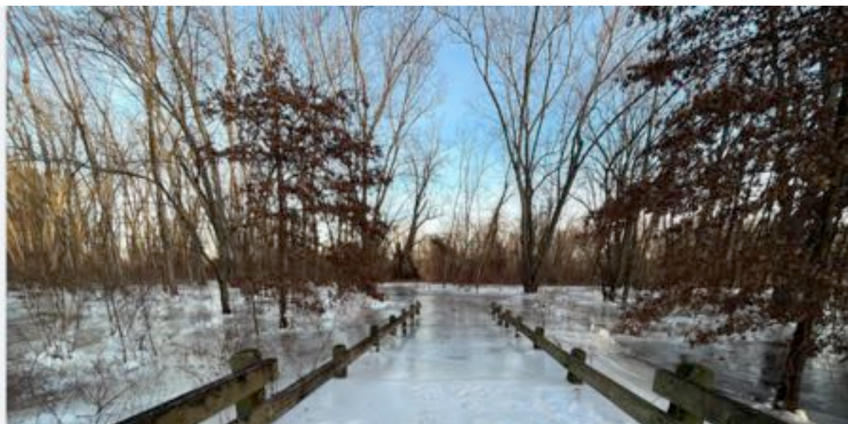
December, 2022

Please note in the subject line "USH Enews." Thank you for your submission! Email to: hartforduusociety@gmail.com