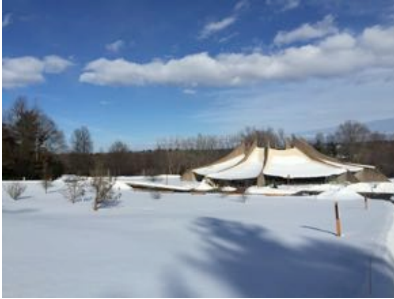
December 2022