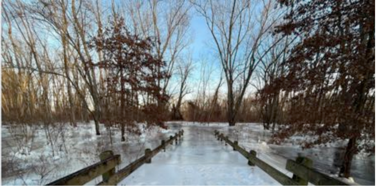
December, 2022

The deadline for USH Enews submissions is Tuesday at Noon. Please note in the subject line "USH Enews." Thank you for your submission! Email to: hartfordusociety@gmail.com