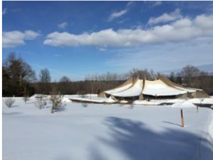
December 2022