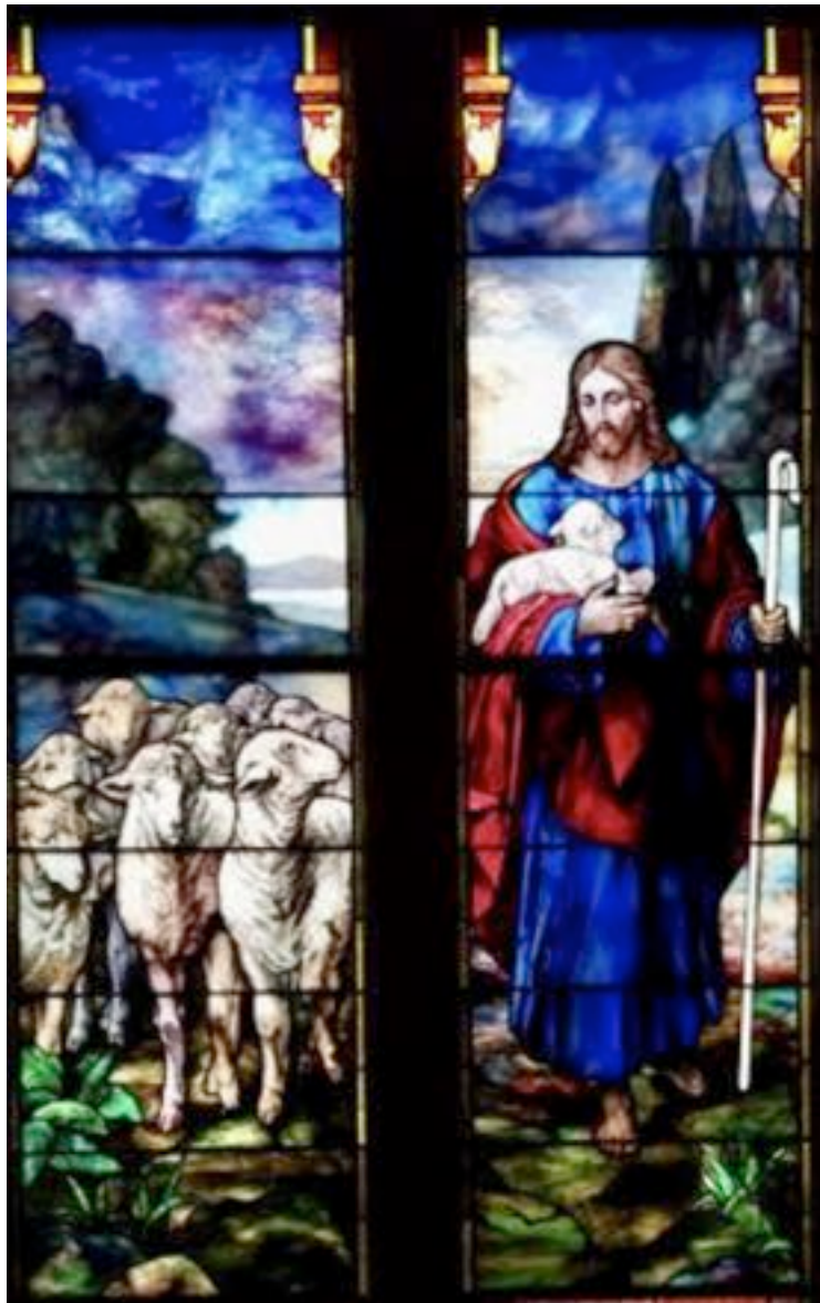
Universalist Church of West Hartford window