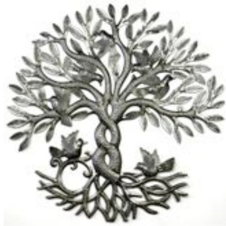
Haitian Tree of Life made from recycled steel drum barrels.

Office Administrator's Hours: Sunday through Thursday, 9:00 a.m. to 2:00 p.m. Please feel free to email/call for an appointment.