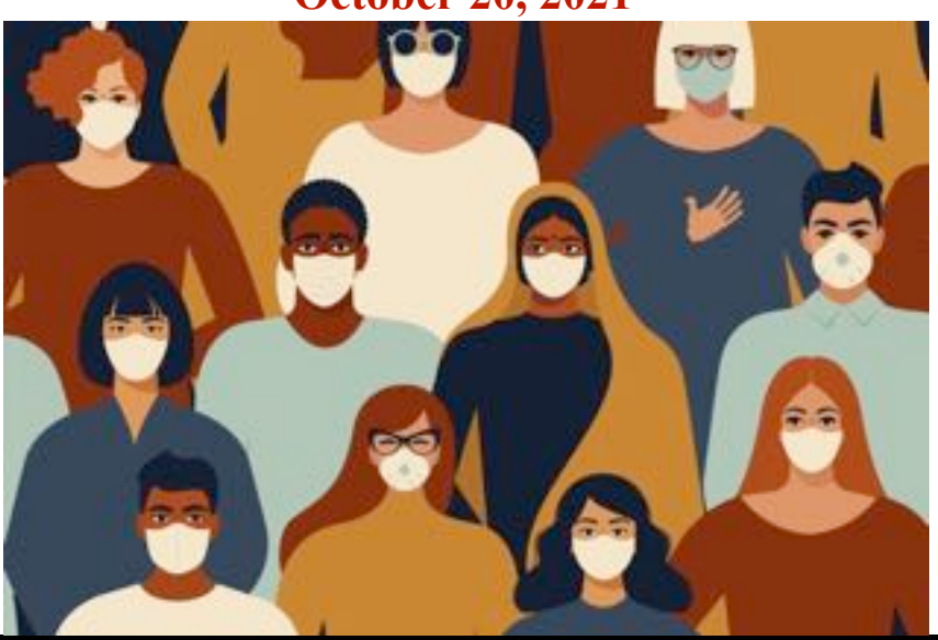
October 24th, 2021, 10:30am