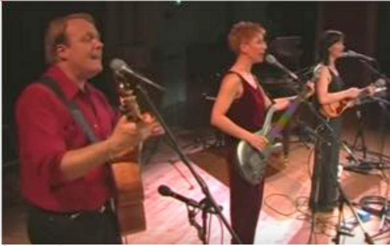
One Wild Dove video