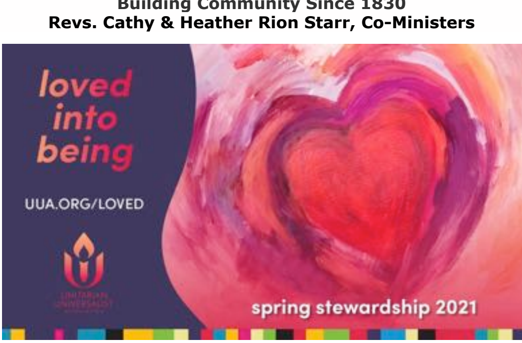
Building Community Since 1830