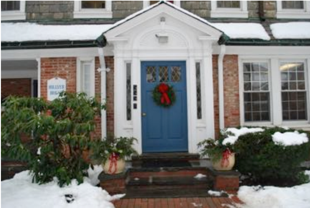
Seasons Greetings from your Friends and Neighbors at The Village for Families and Children